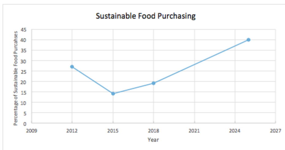
Figure 1: Ohio State Sustainable Food Purchasing

There were several barriers to these methods. One barrier was a lack of response from university officials in order to determine how they plan on increasing sustainable food purchasing. Another barrier was the lack of access to data because many of Ohio State’s purchasing decisions are privatized and not available to the public.