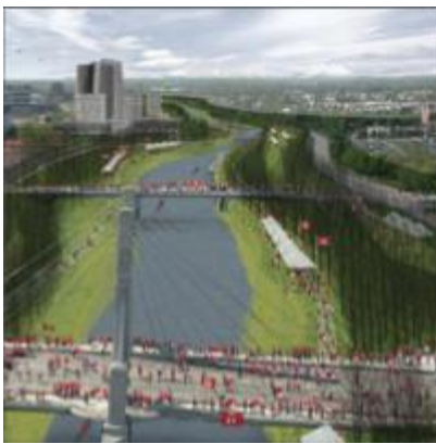
Figure 2. Framework Plan with the proposal to create green space along the Olentangy (The Ohio State University, 2010)

Since the adoption of Sasaki’s Framework plan in 2010, Ohio State has been committed