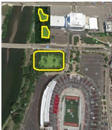
Figure 3. Our design proposal with new recreation areas contained within green space along the new CFAES campus (Google Maps, 2014)

importance of also restoring the rest of the Olentangy corridor.