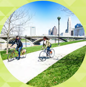
SMART AND RESILIENT COMMUNITIES