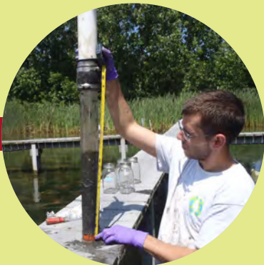
HEALTHY LAND, WATER AND AIR SYSTEMS